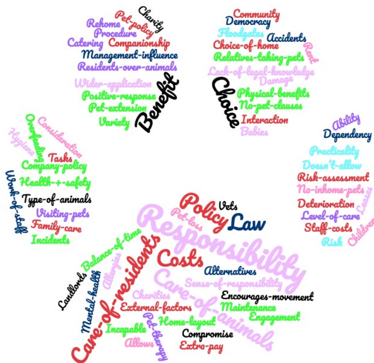
Diagram 2 – Codes Found in the Data

Form these codes, we came up with six themes: